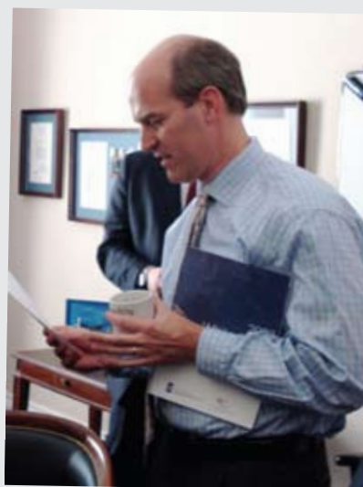
Rep. Rick Larsen (D-WA) with AmCham's 2007 White Paper in hand

White Paper, and to a significant degree AmCham's overall policy agenda, the PPDC plays a major role in the government relations activities of the chamber. In addition to the White Paper, it also works on numerous policy statements, such as submissions and comments in response to new draft laws and regulations, trade policy negotiations and reports on the status of the US-China trade relationship. As AmCham's policy driver, the PPDC and its members also participate in many high-level government meetings with both Chinese and US government officials and relevant stakeholders.