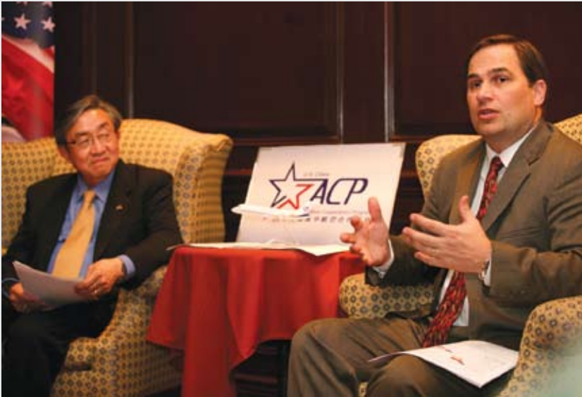
RUDER SINN PR