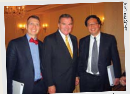
AmCham members with Tom Ridge (center) during the 2008 Washington Doorknock

Founded in 1998, the Public Policy Development Committee (PPDC) leads AmCham's policy and advocacy development process. The PPDC provides leadership to forums on advocacy strategies and policy issues, and takes a lead role during the annual White Paper process. AmCham's White Paper, published each spring, presents the official chamber positions on trade and commercial issues affecting the US business community in China and the PRC's overall business environment. It also gives recommendations for both the US and Chinese governments on how improve the business climate. In addition, it gives a year-on-year assessment of progress at AmCham. The bilingual White Paper is the most important policy document that the chamber publishes each year.