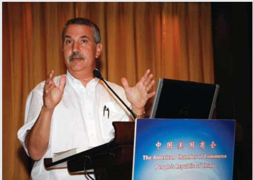
Thomas Friedman addressing the AmCham community about environmental issues